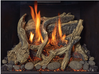
10 Piece Highly Detailed Driftwood Fyre-Art™