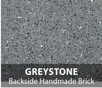
GREYSTONE Backside Handmade Brick