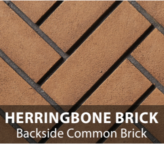
HERRINGBONE BRICK Backside Common Brick