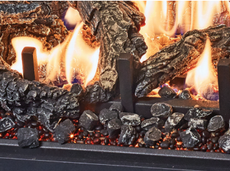
Ember-Glo™ Ember Bed Lighting