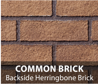
COMMON BRICK Backside Herringbone Brick