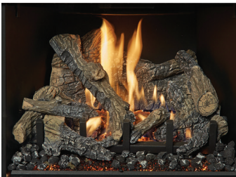
10 Piece Highly Detailed Classic Oak Log Set