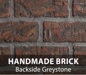
HANDMADE BRICK Backside Greystone