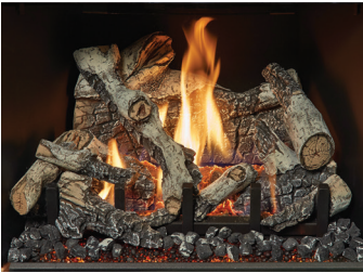
10 Piece Highly Detailed Birch Log Set